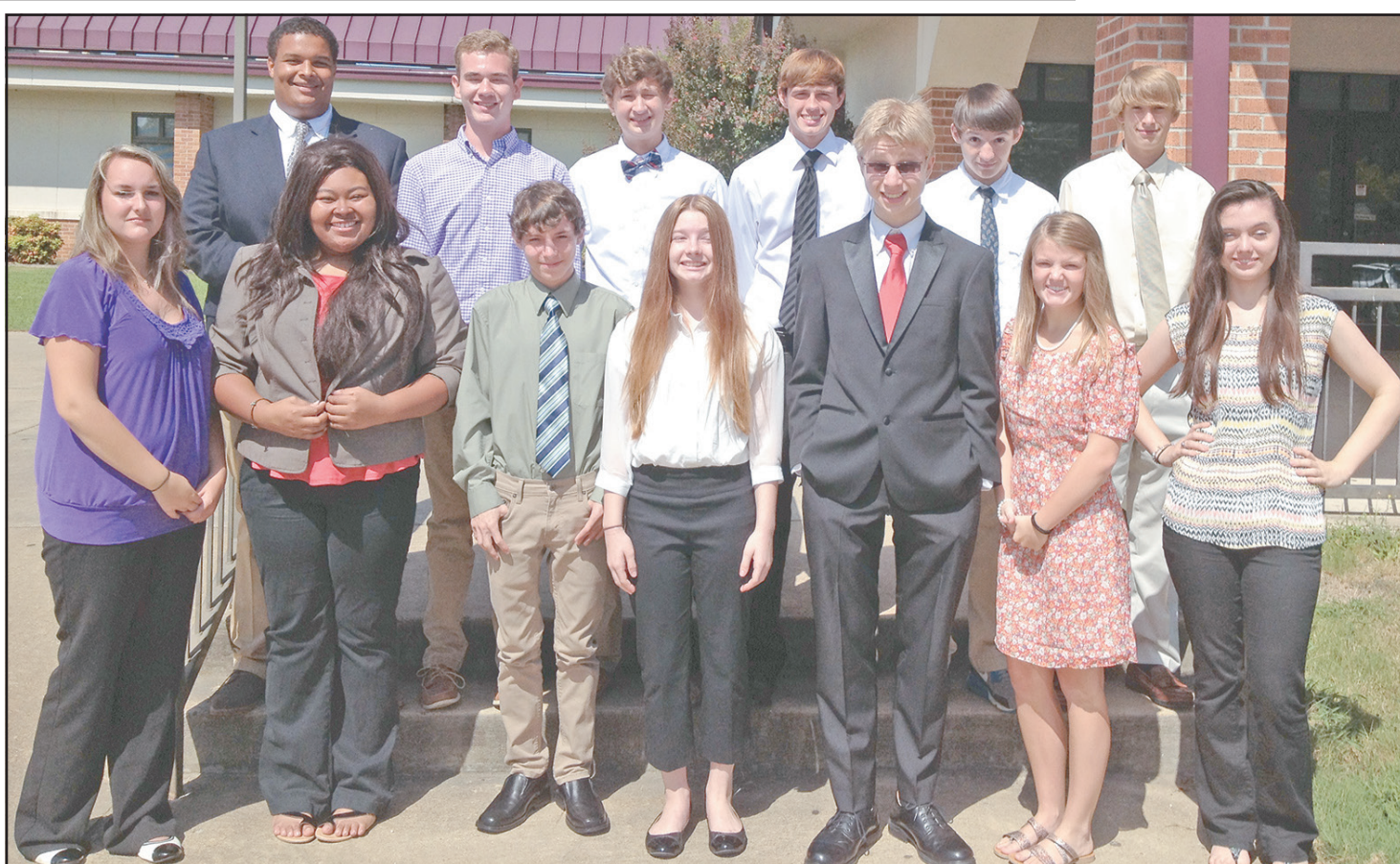
HCHS Virtual Enterprises International