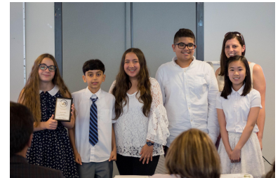
3rd Place Life-Watch William McKinley J.H.S. 259