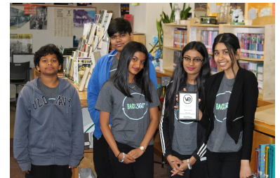
3rd Place Bags360 America's School of Heroes M.S. 137