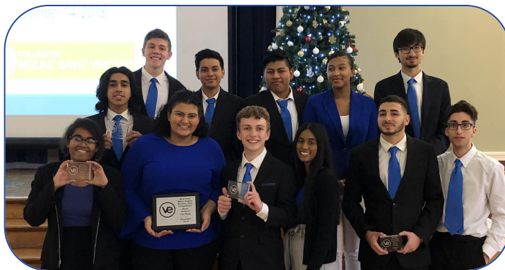
1st Place: Blutivity Yonkers High School