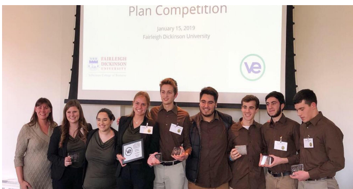
Deja Brew - Morris Knolls High School