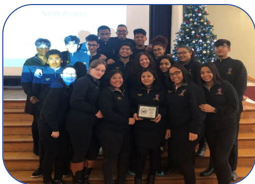
Finalist Suave Eats In Tech Academy