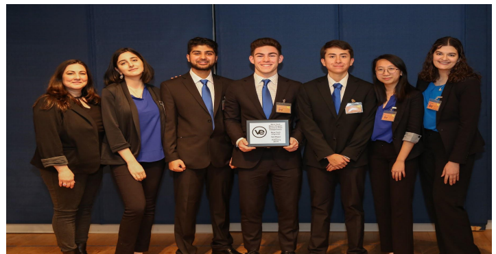
VEKO - Edward R. Murrow High School