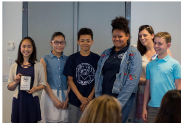
2nd Place Aqua Feet William McKinley J.H.S. 259