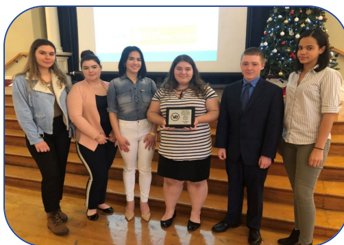
Finalist Bearables Inc. Yonkers Montessori Academy