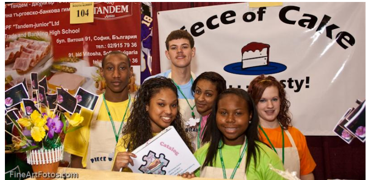
Piece Of Cake Inc - Ewing High School, NJ NYC Trade Fair 2010