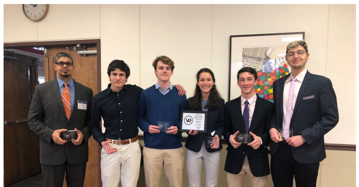
Bloom Technologies - Germantown Friends School