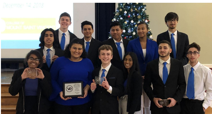
Blutivity - Yonkers High School

The New York Metro Region of Virtual Enterprise conducted business plan competitions from December through February. 75 teams from NYC, Yonkers, Wappingers Falls, Pennsylvania and New Jersey prepared written business plans, slide shows and 8-10 minute oral presentations. Students impressed the judges with answers to questions designed to elicit critical-thinking skills. Many teams were mentored by business professionals from private firms such as Viacom, NBC Universal, Deloitte, FedEx, Morgan Stanley, BNP Paribas and many more. Congratulations to the four First-Place winners in the New York Metro Region shown below!