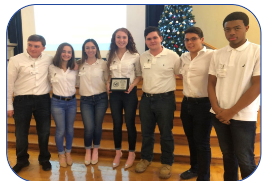
Finalist In Site Media John Jay Senior High School