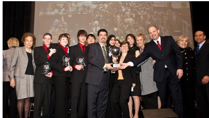
VE Law - New Dorp High School, NY National Business Plan Champions 2010