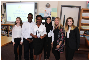
1st Place Spartan Des1gns Edwin Markham I.S. 51