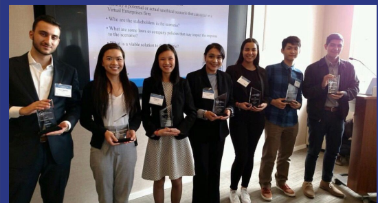
2017 CEO Day at Deloitte Fall Executive Conference