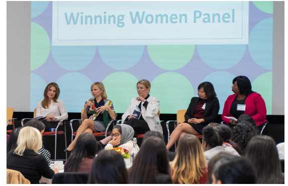
Our morning panelists