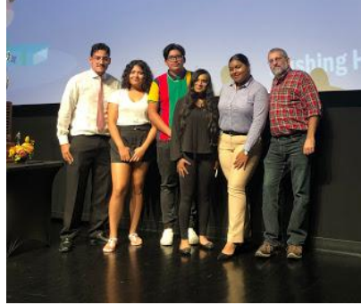
2nd Place – Flushing High School