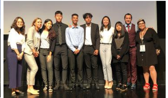
3rd Place – Francis Lewis High School

On September 26, more than 150 students from NYC high schools participated in the Sixteenth Annual Advertising Futures Competition hosted at the SVA Theatre. The competition pairs advertising agency mentors from across NYC with teams of students to create an advertising campaign based upon a brief developed by the Ad Council. The Ad Futures Competition is a much-anticipated event of Advertising Week, the largest and most prestigious annual gathering of advertising and media industry leaders in North America.