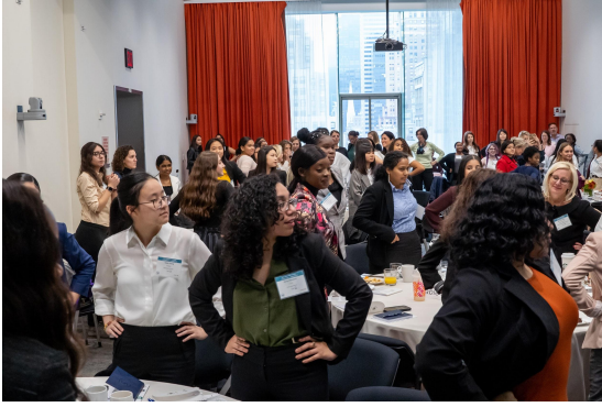
VE students showing off their “ Power Poses ”