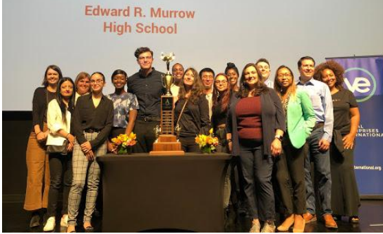
1st Place – Edward R. Murrow High School

Students from Edward R. Murrow High School Win the 2019 Ad Futures Competition With Dynamic Campaign to Encourage Girls to Study and Pursue Careers in STEM.